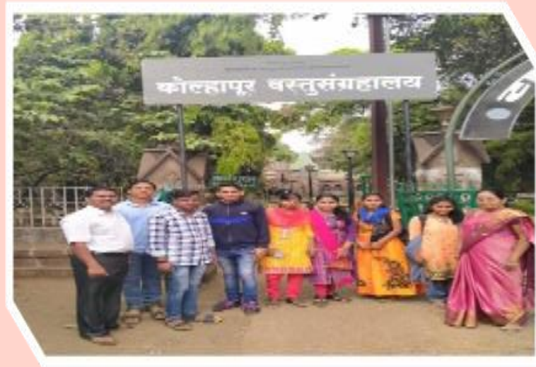
Visits to Kolhapur Museum