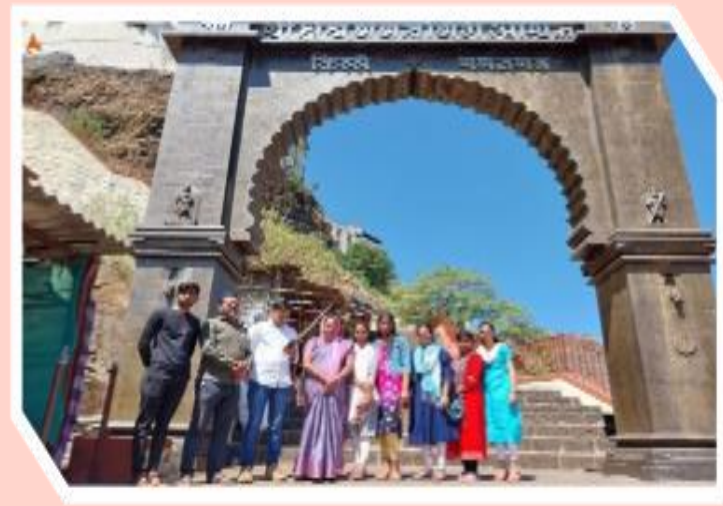
Educational trip to Gagangiri